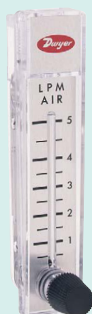
Model RMA-SSV 2" scale, 4 1/4" high