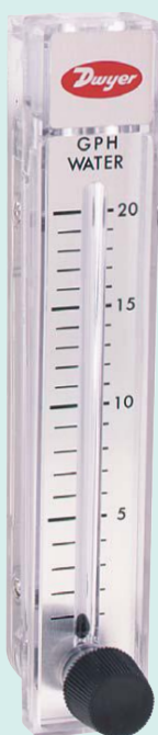
Model RMB-SSV 5" scale, 8 3/4" high