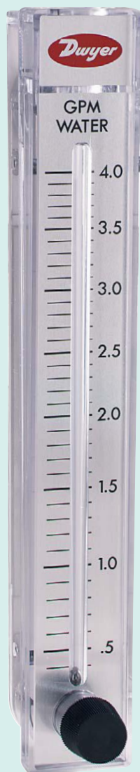
Model RMC-SSV10" scale, 15 1/2" high